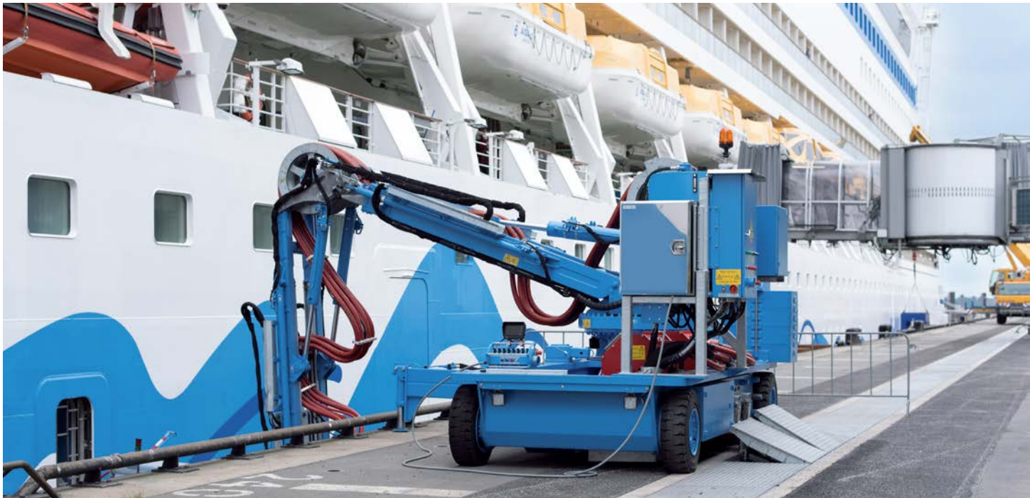
Quick and easy connection to the ship via the cable management system